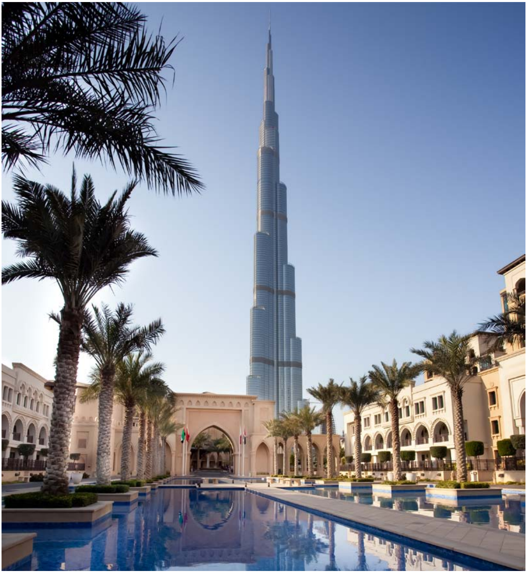
Photography All photographs: gettyimages