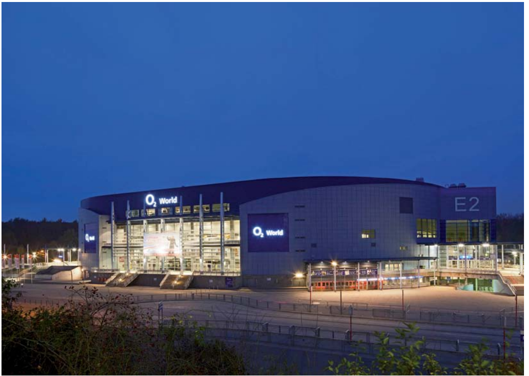
Photography Press photographs O 2 World Hamburg