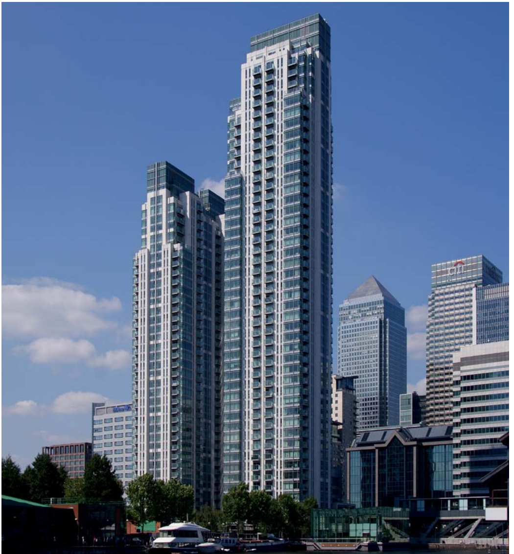
[desaturated from original]